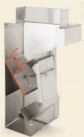
Cross-section of Rev-Low showing patented adjustable baffles.